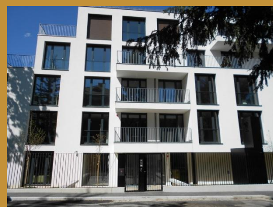
New building of the UAE Permanent Mission's Office in Vienna