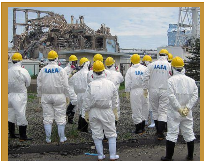
IAEA fact-finding team in Japan visit the Fukushima Daiichi Nuclear Power Plant after the accident

"The Convention on Assistance in Case of a Nuclear Accident or Radiological Emergency and the Convention on Early Notification of a Nuclear Accident are the prime legal instruments that establish an international framework to facilitate the exchange of information and the prompt provision of assistance in the event of a nuclear accident or radiological emergency. They place specific obligations on the Parties and the IAEA, with the aim of minimizing consequences for health, property and the environment."