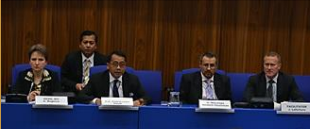
Sixth meeting of representatives of competent authorities to the Convention on Early Notification of a Nuclear Accident and the Convention on Assistance in the Case of a Nuclear Accident or Radiological Emergency, Vienna, Austria