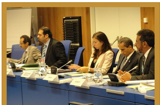
The Permanent Mission actively engages with the IAEA TC Department in various meetings among which coordination meetings, to plan upcoming TC projects

GCC Ministerial Conference decisions have been highlighted during the meeting to guide future work in these areas.